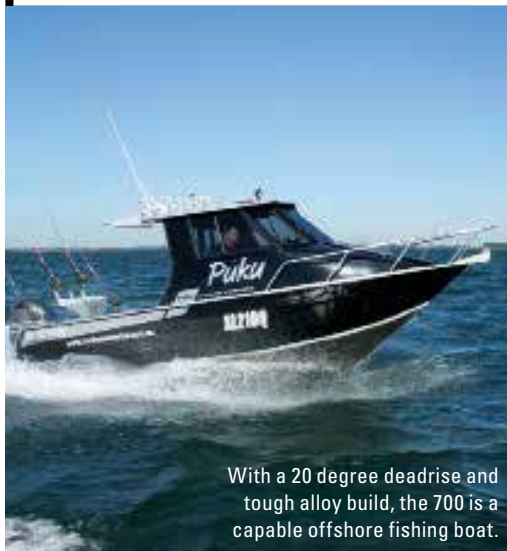
With a 20 degree deadrise and tough alloy build, the 700 is a capable offshore fishing boat.

The Surtees was fitted with the newly designed Yamaha F200XB four-stroke outboard. This is the new in-line four-cylinder engine as opposed to the V6 engine block. The new 200hp four-stroke is more than 50kgs lighter than the