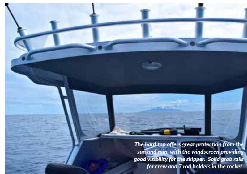
The hard top offers great protection from the sun and rain, with the windscreen providing good visibility for the skipper. Solid grab rails for crew and 7 rod holders in the rocket.

This year Surtees decided on introducing the 540 Workmate Hardtop and it was launched at the 2018 NZ Hutchwilco Boat Show, where it picked up the best 'Specialist Fishing Boat up to 6m'. So, it obviously appealed to the industry judges, but how would it go on the water with a bunch of regular fishos?