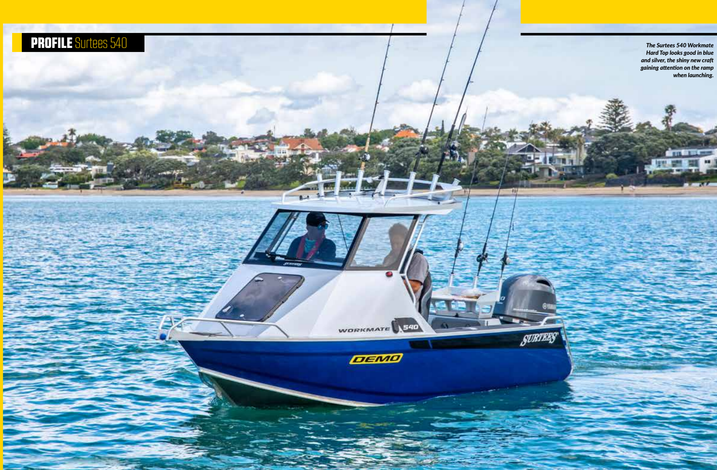
The Surtees 540 Workmate Hard Top looks good in blue and silver, the shiny new craft gaining attention on the ramp when launching.

We took one from North Shore's Fishing Boats NZ out for a late spring fishing trip when the gulf was firing. Launching the boat at Takapuna boat ramp and it got a lot of stares and attention in its bright blue paint job. It was matched to a Yamaha F90hp and with an 100L fuel tank, we had plenty for our party of three to head out wide off Kawau in search of the work-ups.