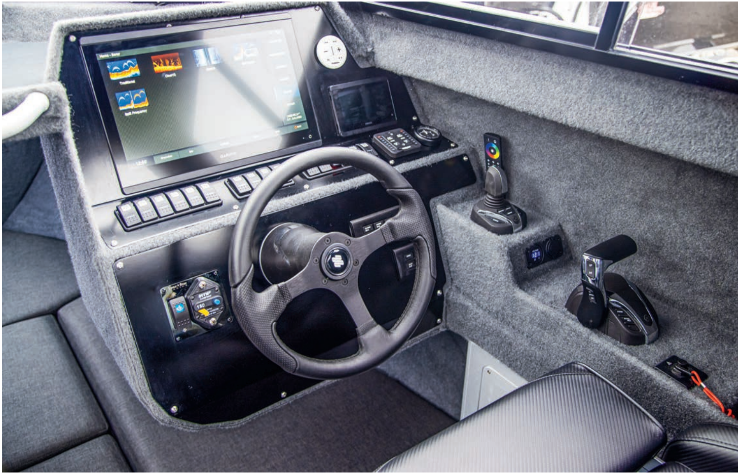
The upgraded Surtees helm station has everything at the skipper's fingertips.

One of the tools found on many of the best fishing boats today is an electric motor. These are used in several ways – to determine a drift along a favourite reef, to hold over a school of fish and to prospect shallow water in a way that doesn't unduly panic the residents!