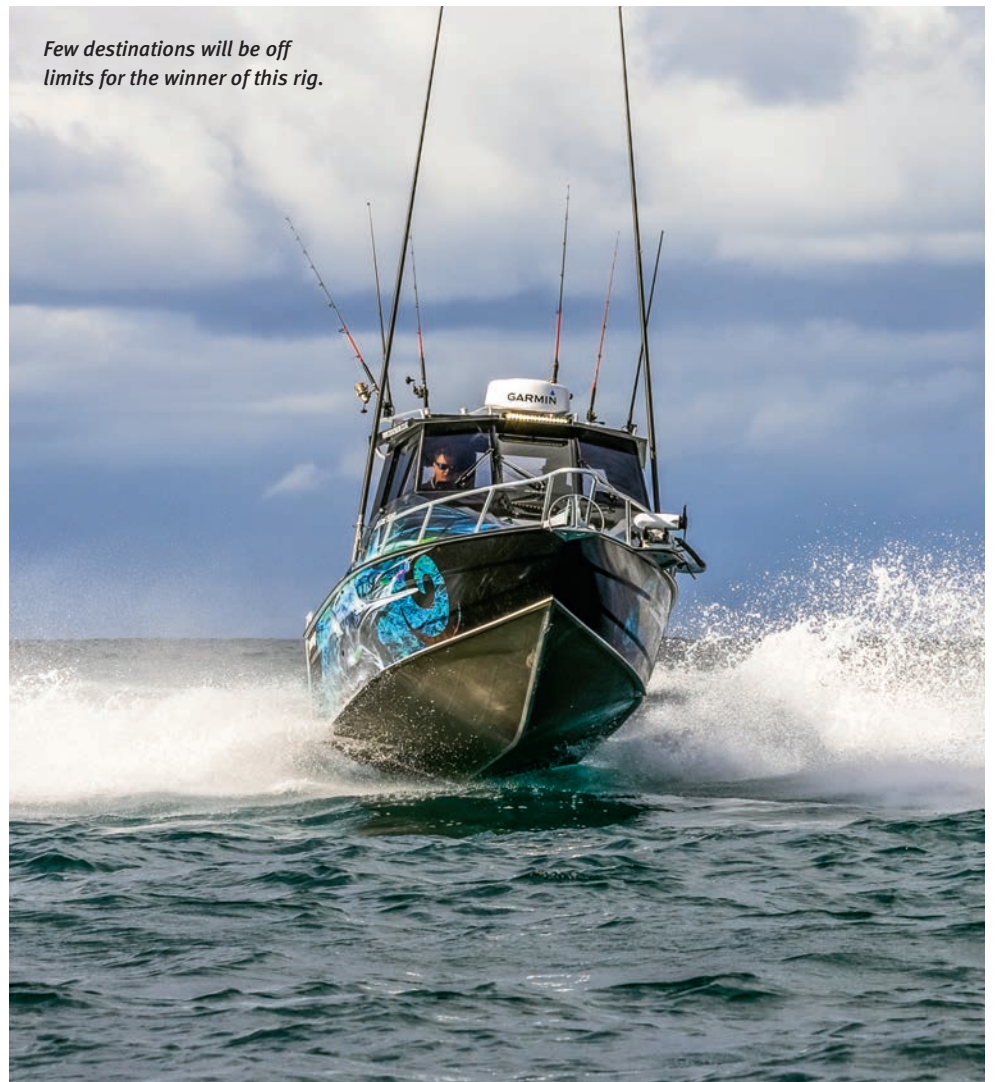
Few destinations will be off limits for the winner of this rig.

One of the features I have enjoyed in many of both my personal and magazine project boats in recent times has been the application of SeaDek on all areas where I have wanted a firm grip underfoot. There is SeaDek throughout the prize boat –