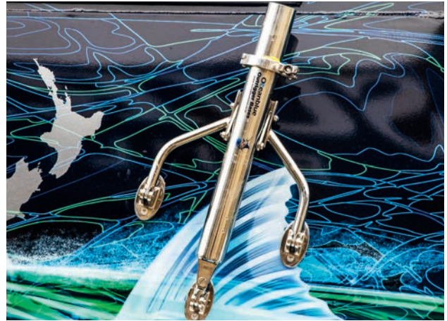
A Hutchwilco safety grab and cooler bags are part of the prize list. Right: The Surtees is well set up for sportfishing, including Oceanblue outrigger bases.