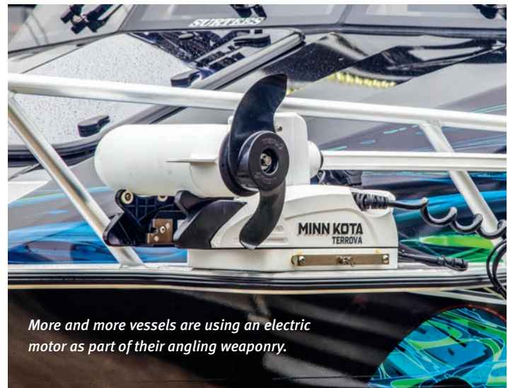
More and more vessels are using an electric motor as part of their angling weaponry.

The system operates the Trojan brakes, the components