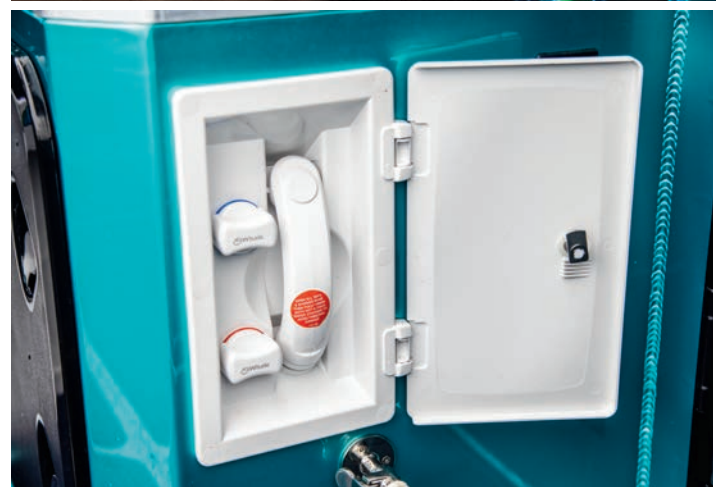
A hot-water shower, toilet and fridge are all part of the package.

of which are all stainless steel to minimise corrosion. Hella have provided the lights and retrieving is made easy thanks to a Fulton XLT 4.5 tonne capable electric winch which is backed up with