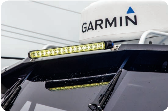
Hella have supplied a comprehensive lighting fit-out for the prize boat.

includes four rod holders and a handy drawer for all the fishing tools and gear you need to have handy. A Jabsco washdown system is also part of the fitout, making the final clean-up job that much easier as the blood and guts can be washed away during the day.