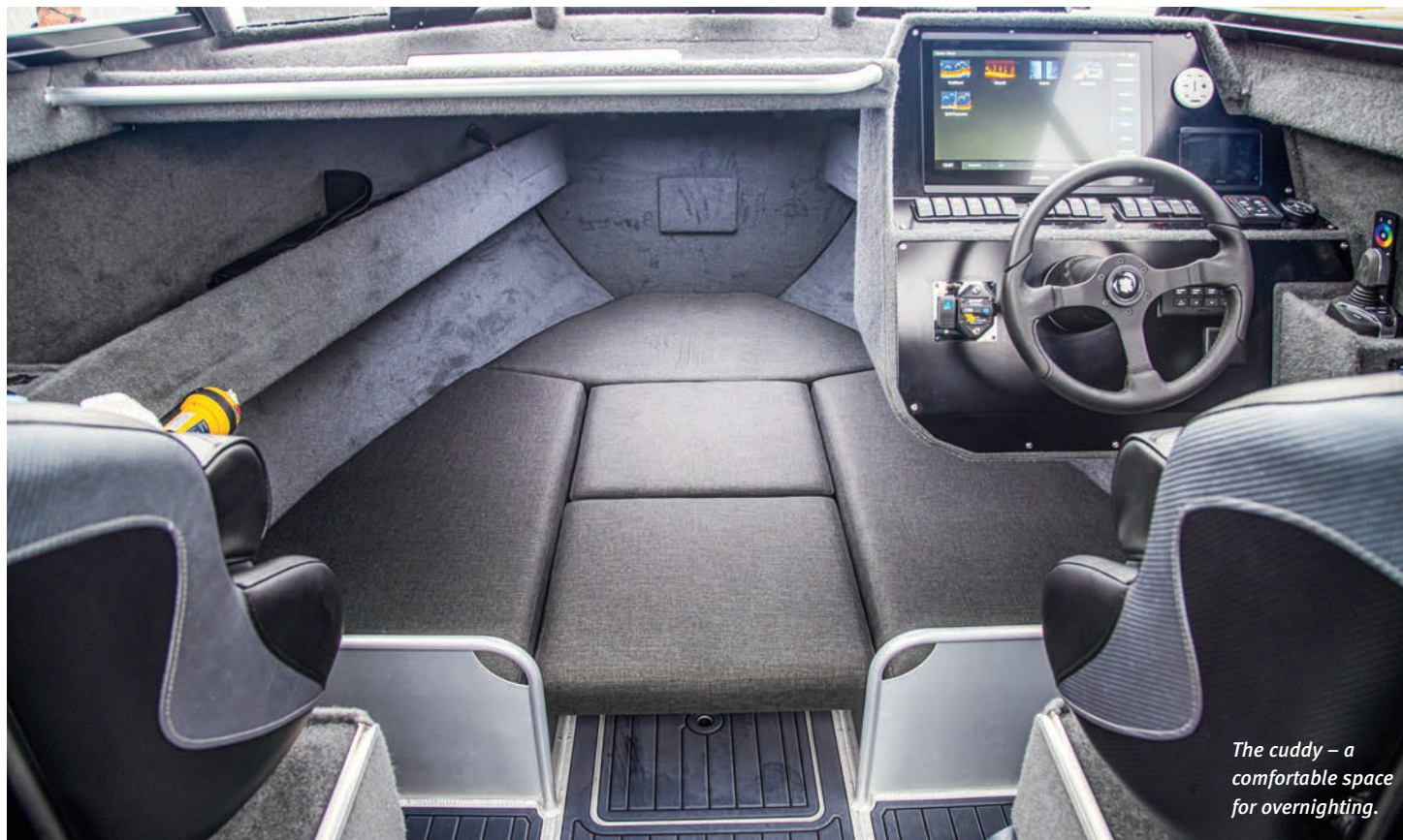
The cuddy – a comfortable space for overnighting.

to drive their boats on and off the trailer.