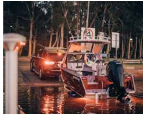
FEATHERWEIGHT: With a measly BMT dry weight of 1,100kg the 540 Workmate Hardtop is a cinch to tow.