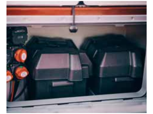
DOUBLE TROUBLE: The dual-battery system is tucked away in a sealed compartment above the deck.