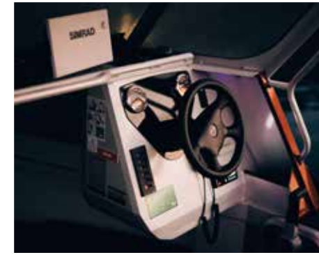
SOUND SELECTION: The 540 Workmate Hardtop is fitted with a Simrad NSS9 Evo3.