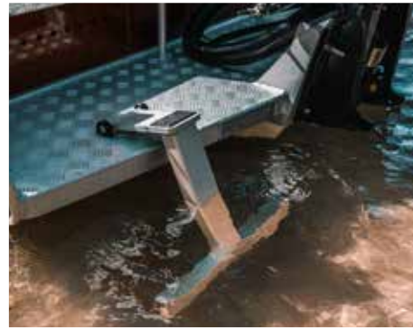
1, 2 STEP: The flip-down boarding ladder is simple and functional.