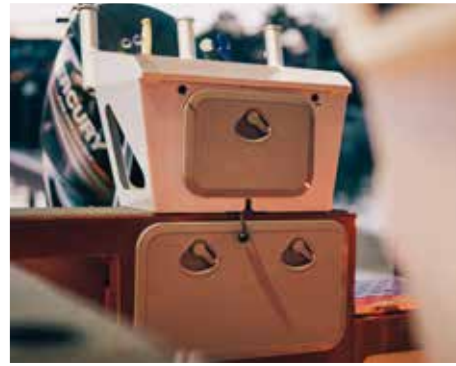
WATERGATE: The black cord underneath the bait station is used to open/close the shut-off gate for the water ballast.