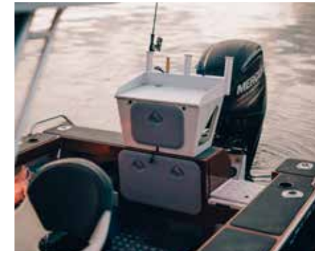
CHICKEN DINNER: Wide gunwales, big cockpit and great bait station configuration – winner, winner.